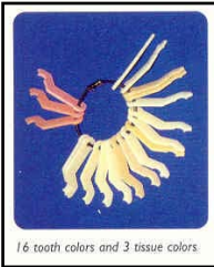
16 tooth colors and 3 tissue colors.